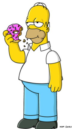
Homer gg, ff, ss, bb